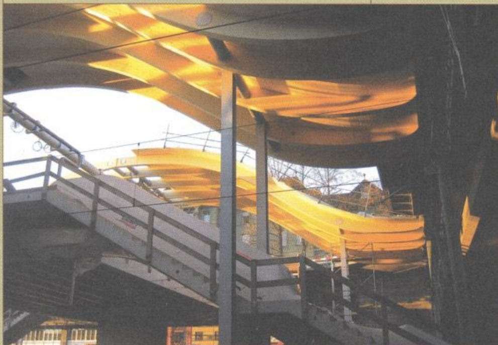
Left: 'Wave' for Bern, Westgate Main Station, Switzerland, 2005. Architect: Smarch. One of three major civic projects in the group Unexpected Departures which demonstrated how timber can match steel in strength and durability.

Projects were chosen that made enlightening and inspiring use of timber and demonstrated the beauty and usefulness of this material