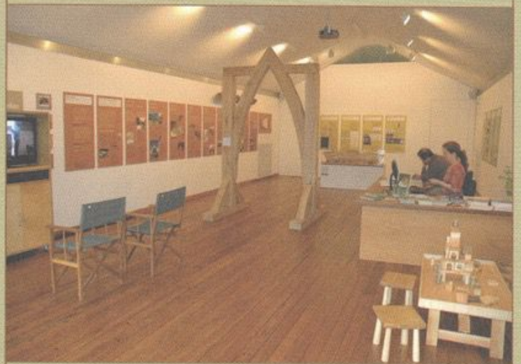
Above: Wood Wisdom exhibition at CCANW's Project Space.