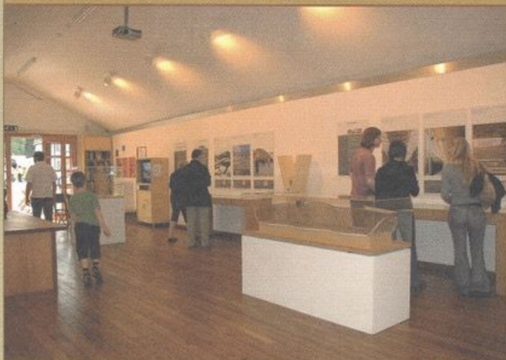
Above: Inspiring Futures exhibition at CCANW's Project Space.

Projects were chosen that made enlightening and inspiring use of timber and demonstrated the beauty and usefulness of this material