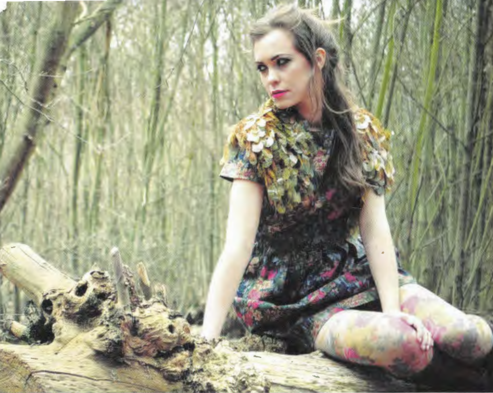
(Left): Cape by Michelle Lowe Holder & dress by Minna Hepburn from CCANW's Eco-fashion Show in the Forest. (Below): Hand-stitched in 100 per cent organic cotton, Maggie's All-Over Dress from Alabama Chanin uses localised production systems that help to counter "out of sight, out of mind" abuse in the fashion industry.