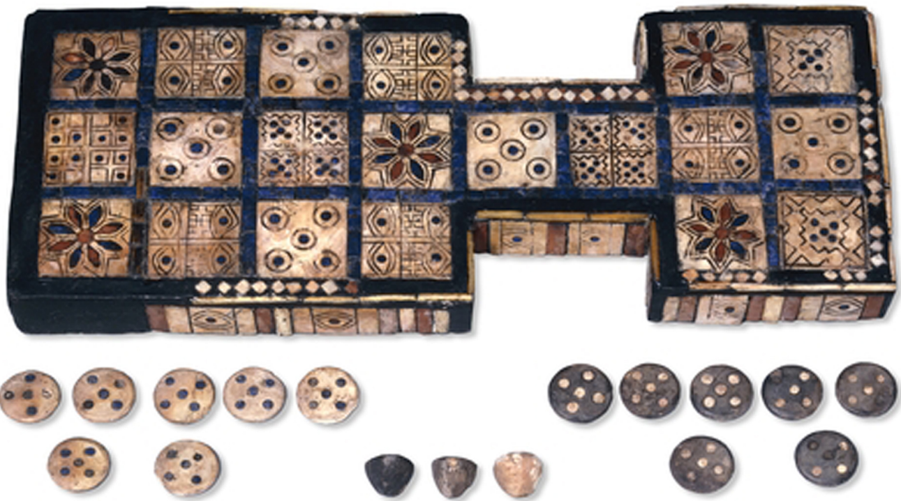
The Royal Game of Ur, from Ur, southern Iraq, c.2600-2400 BC. Collection: The British Museum

Admission £5. Booking essential. Light refreshments