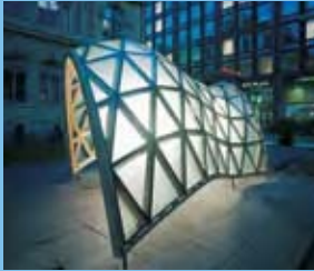
04 Information pavilion in the park of the Ateneum Art Museum, Helsinki, 2004-5