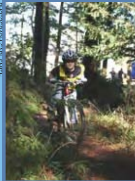
16 Exeter Mountain Bike Club half term riding school, 2007