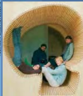
06 Summer sauna on the shore of lake Jyväsjärvi, Jyväskylä 2004-5

The Wood Studio at HUT was launched in 1994 with the support of the Finnish Timber Council (and the City of Helsinki), the idea being to learn about wood by practical experimentation and by focusing on future needs. In 2001, the English language Wood Program for international students was added.