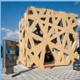
02 Information pavilion, Espoo Housing Fair, 2006