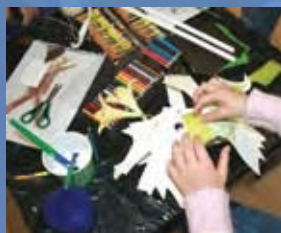
09 MED Theatre's Designing with Nature workshop

Part of the workshop involves casting your face in plaster