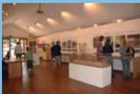
07 Exhibition Inspiring Futures: European Timber Architecture for the 21st Century in CCANW's Project Space, July-September 07