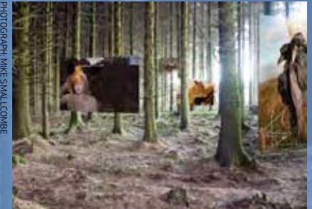
13 Ghosts in Wood (artist's mock-up)