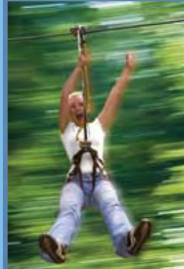
17 Go Ape