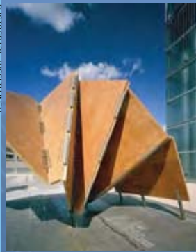
05 Information pavilion, Masters of Art festival, University of Art and Design, Helsinki 2006-7