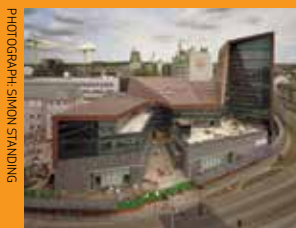
01 Roland Levinsky Building under construction

Launch: Sunday 7 October, 2-4pm Short presentation at 2.30pm Light refreshments