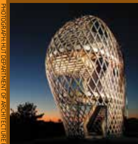
14 Lookout Tower, Korkeasaari Zoo, Helsinki. Architect: Ville Hara/HUT

Make Christmas decorations out of natural forest materials. This workshop is run in conjunction with the Forestry Commission.