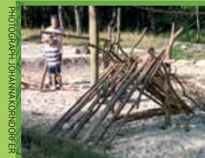
06 Den building at Haldon