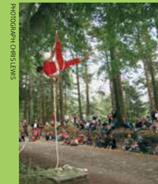
12 Jeremiah Krage performance during The Big Picnic, Haldon Forest Park, 13 August 06