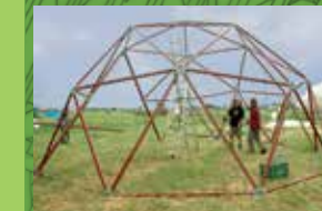
07 Geodesum, Bude erecting a geodesic dome