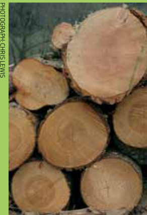
05 Douglas Fir timber at Haldon