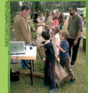
15 Visitors enjoying the Kayagum, wired up with contact microphones, Easter Bank Holiday 2007

Haldon's mobile café is open every weekend and on Bank Holidays, selling delicious ice creams, filled crêpes and organic fruit drinks.