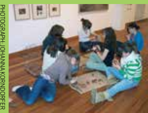
04 Coombeshead Community College students taking part in Enquire programme

Craftsman Sean Hellman has been working with sections of the different tree species grown at Haldon to reveal the qualities of the wood within. He is also starting to work on developing a 'timber trail'.