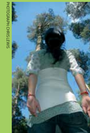
10 Felt sling prototype, Haldon Forest 2006