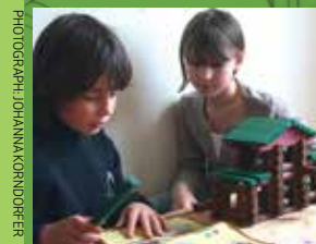
08 Building with wooden Lincoln Logs invented in 1916 by John Lloyd Wright, son of famous American architect Frank Lloyd Wright

Background image: Line drawing, Carpenter Oak Ltd., Devon