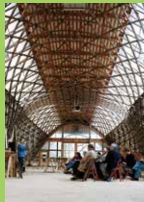
01 Downland Gridshell, built in 2002 for the Weald and Downland Open Air Museum. Edward Cullinan Architects