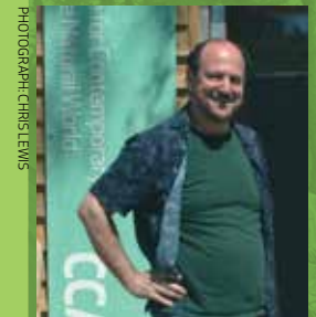
14 Alan Sonfist at CCANW's Project Space, July 2006