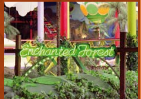
02 Nicola Maxwell's Enchanted Forest from the Calypso's Island series (detail) 2006, lightjet print

The experience of entering a forest stimulates our imagination and sharpens all of our senses. The feelings it can evoke can range from ones of fear and mystery to those of enchantment and wonder. This year-long, evolving exhibition shows work by over 50 artists who have responded in different ways to the forest environment.