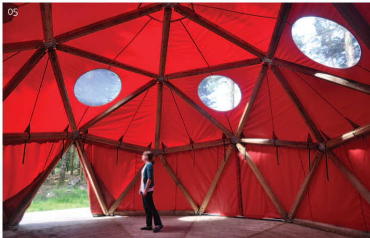
05 Made of local larch and sweet chestnut by Woodmanship and Albion Canvas with funding from Arts Council England, Forestry Commission, Exeter Foundation and Solarsense UK Ltd.

*You can now book and pay online on the 'Upcoming events and Brochure' page http://tinyurl.com/9e5bg4u