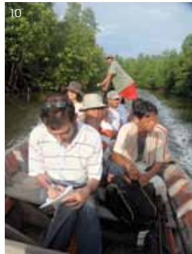
10 Voices of the Forest: Thailand

Part of the travelling Forest Film Festival, these films are also available free of charge to community groups. Please contact CCANW for details.