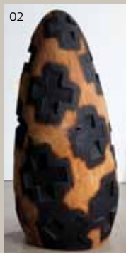
02 David Nash Charred Cross Egg 2003, oak

Dartmoor Arts, in collaboration with CCANW, will be hosting a talk by David who will talk about his artistic practice, followed by an informal discussion.