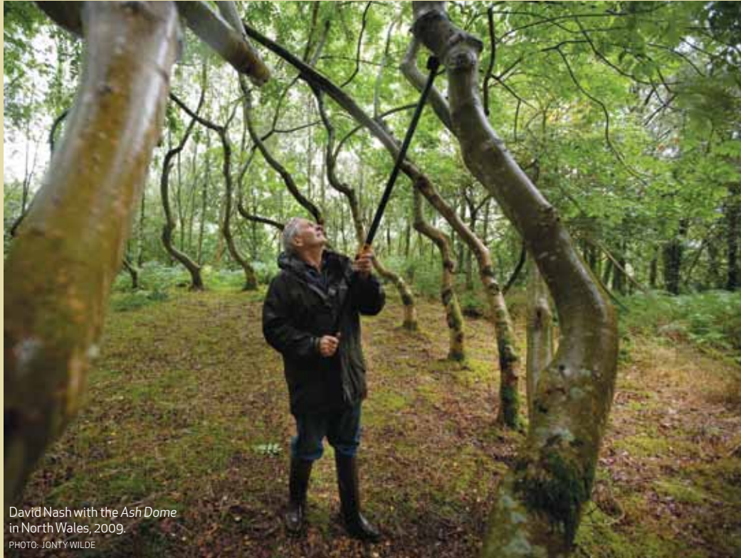
David Nash with the Ash Dome in North Wales, 2009.