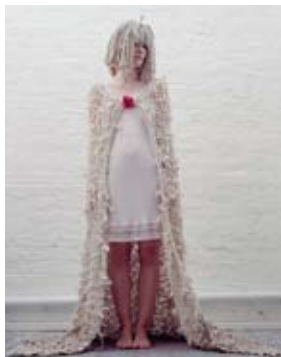
Organised in collaboration with Textile Forum South West and Plymouth College of Art (where it will be shown 9 Sept-23 Oct).