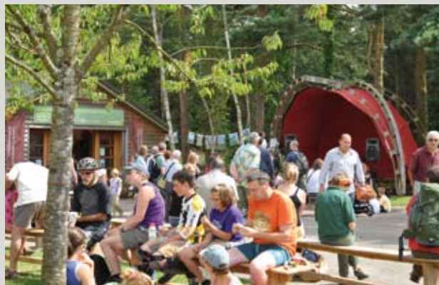
09 Art in the Park, August 2009

Because CCANW was told in mid-January that its application for Arts Council funding had not succeeded due to insufficient 'match funding', CCANW launched an appeal and successfully raised £20,000 from donations, a new Friends scheme and several Trusts in the region. Our re-application has now succeeded and we would like to thank everyone who contributed so generously and promptly.