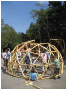
03 Constructing the dome