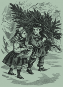
06 Gathering Christmas Greens, an illustration from c.1876