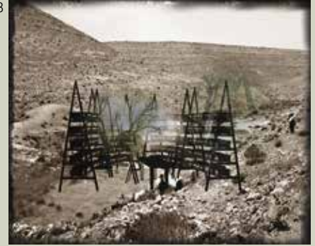
01 The Cement Dress – Social Self-Portrait Colour photograph, 2003, previously a sculpture, 2000