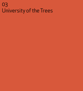
03 University of the Trees

Exhibition: Wonder Wood Inspirational Contemporary Designers from the South West Saturday 19 July-Sunday 14 September Admission free