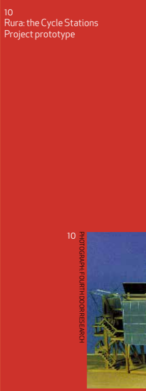
10 Rura: the Cycle Stations Project prototype

Exhibition: Riding on Empty Designing our travel infrastructure for the end of oil Saturday 20-Sunday 28 September Admission free