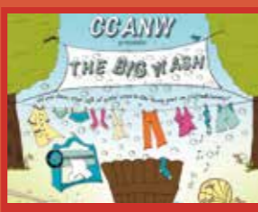
04 David Haines and Teignmouth Community Choir at CCANW, 2007

Bird of Prey viewpoint is a 20 min walk from the main car park. Please contact CCANW for disabled access drop-off point