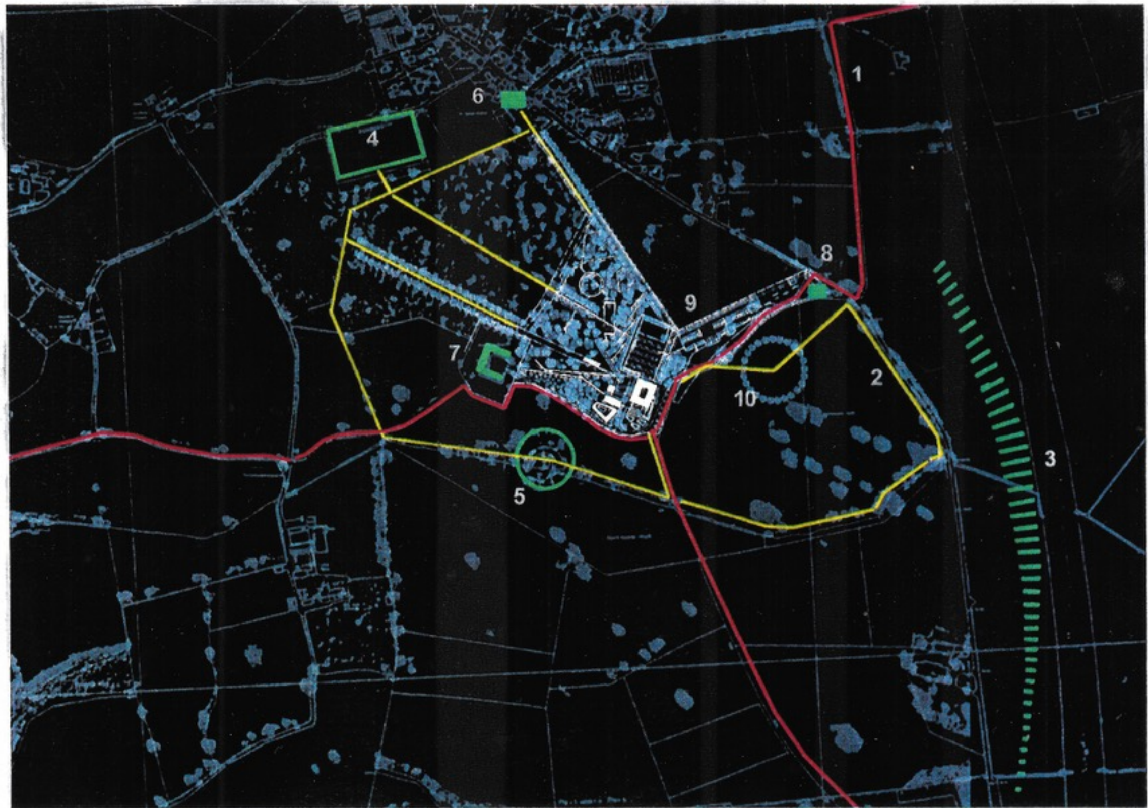
CONNECTIONS TO SURROUNDING LANDSCAPE