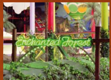
02 Nicola Maxwell's Enchanted Forest from the Calypso's Island series (detail) 2006, lightjet print

The experience of entering a forest stimulates our imagination and sharpens all of our senses. The feelings it can evoke can range from ones of fear and mystery to those of enchantment and wonder. This year-long, evolving exhibition shows work by over 50 artists who have responded in different ways to the forest environment.