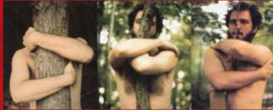
10 Alan Sonfist, from Myself Becoming One with the Tree , photographic series 1969

Since his making of an urban forest in New York City in the 60s, pioneer American artist Alan Sonfist has created numerous landscape sculptures around the world, collaborating with each community to reintegrate aspects of an area's indigenous natural and cultural histories. Alan will tell of his ongoing career and lead a workshop in the forest.