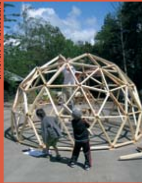
11 Geodesic dome workshop