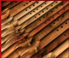
07 Nigel Shaw's hand-made wooden flutes