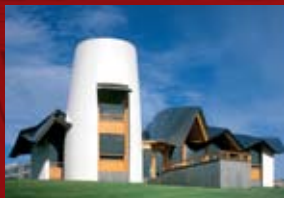
01 Maggie's Centre, Dundee, Scotland 2003. Architect: Frank Gehry

The selection is intentionally diverse and includes buildings of different scales and with very different uses. Our aim in assembling these examples is to demonstrate the creative range of designers working in Europe today and show how they sustain innovative practice.