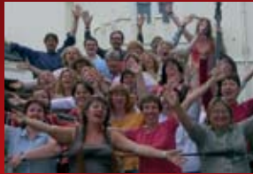
06 Teignmouth Community Choir