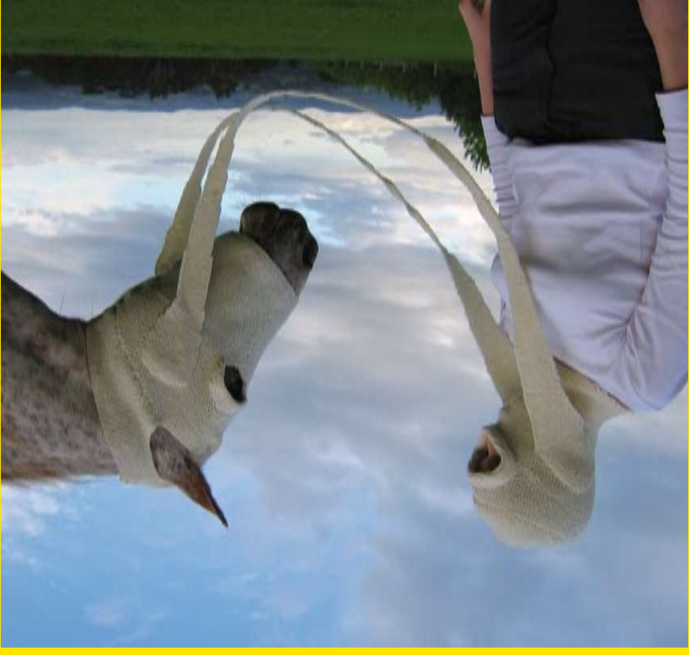
Kate James, The World is a Dangerous Place , at CCANW

Plymouth College of Art 8 January-7 February 2009 Tavistock Place, Plymouth PL4 8AT T: 01752 203434. E: exhibitions@pcad.ac.uk www.pcad.ac.uk