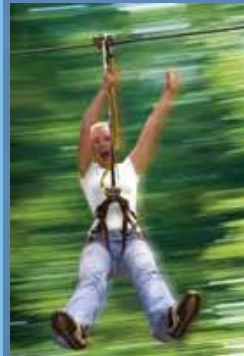
17 Go Ape