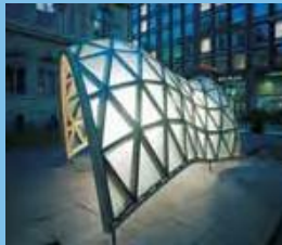
04 Information pavilion in the park of the Ateneum Art Museum, Helsinki, 2004-5

In Finland, wood is an abundant natural and sustainable building resource. In the 1990s, however, it was realized that important wood-working skills had been lost and an entirely new generation of designers of timber buildings needed to be trained.