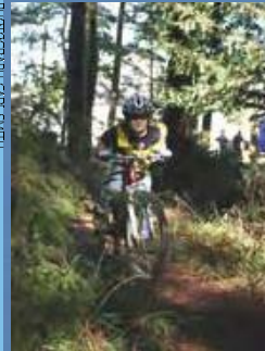
16 Exeter Mountain Bike Club half term riding school, 2007