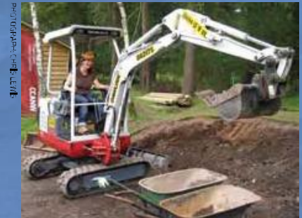
10 Volunteer Gemma Ritchie working on CCANW's outdoor stage

Volunteers make a vital contribution to the smooth running of CCANW's activities. The evening is our way of thanking current volunteers and will provide information on the opportunities for new recruits.