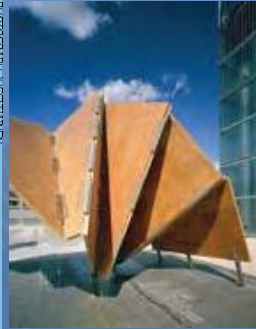
05 Information pavilion, Masters of Art festival, University of Art and Design, Helsinki 2006-7