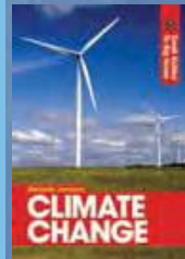
14 'A clear and compelling call for climate justice' Caroline Lucas, Green Party MEP