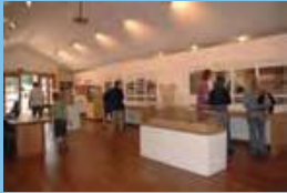
07 Exhibition Inspiring Futures: European Timber Architecture for the 21st Century in CCANW's Project Space, July-September 07