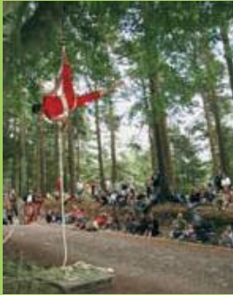
12 Jeremiah Krage performance during The Big Picnic, Haldon Forest Park, 13 August 06