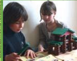
08 Building with wooden Lincoln Logs invented in 1916 by John Lloyd Wright, son of famous American architect Frank Lloyd Wright

Background image: Line drawing, Carpenter Oak Ltd., Devon