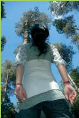
10 Felt sling prototype, Haldon Forest 2006

Project: University of the Trees Tuesday 5 June, 11am-1pm, 2-4pm Admission £6 (£4.50 conc.) Booking essential