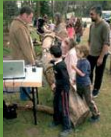
15 Visitors enjoying the Kayagum , wired up with contact microphones, Easter Bank Holiday 2007