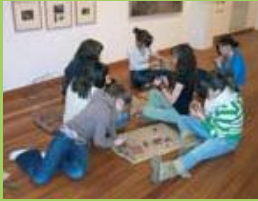
04 Coomeshead Community College students taking part in Enquire programme