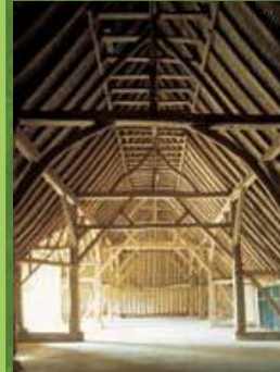
02 The Barley Barn, Essex c.1150-1200. from Architecture in Wood: A World History by Will Pryce, Thames & Hudson

Please note: exhibition closed to the public whilst forums in progress on 9 and 23 June