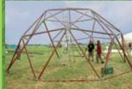
07 Geodesum, Bude erecting a geodesic dome