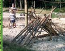
06 Den building at Haldon