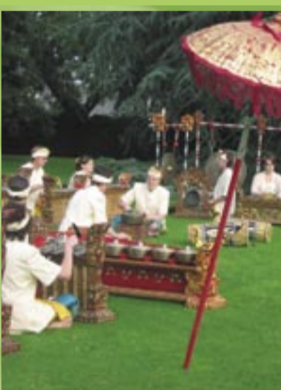
08 Dartington Gamelan.