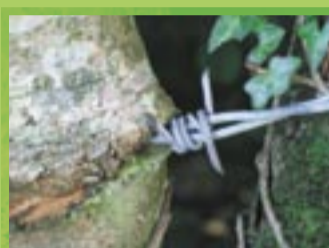
05 Caption to go in here caption to go.